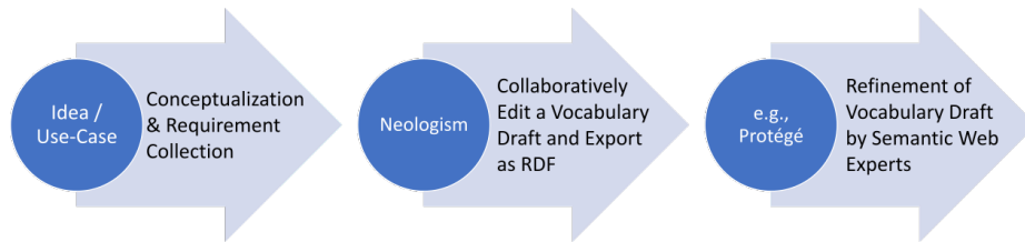
Fig. 1: The vocabulary drafting process embedded into a typical user workflow.