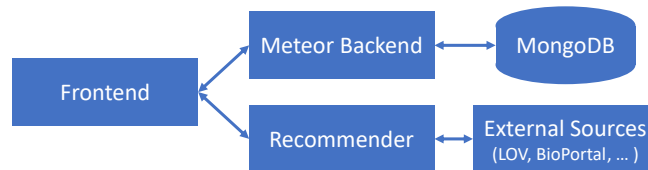
Fig. 2: Neologism 2.0's frontend communicates with a backend to persist information, and might interact with a recommender to improve the quality of drafted vocabularies.

Users create vocabularies in Neologism 2.0's graphical editor; see the screenshots in Figure 3. Only name and description are needed to create new classes, while the URI is auto-completed from a generated ontology base URI and the class name.