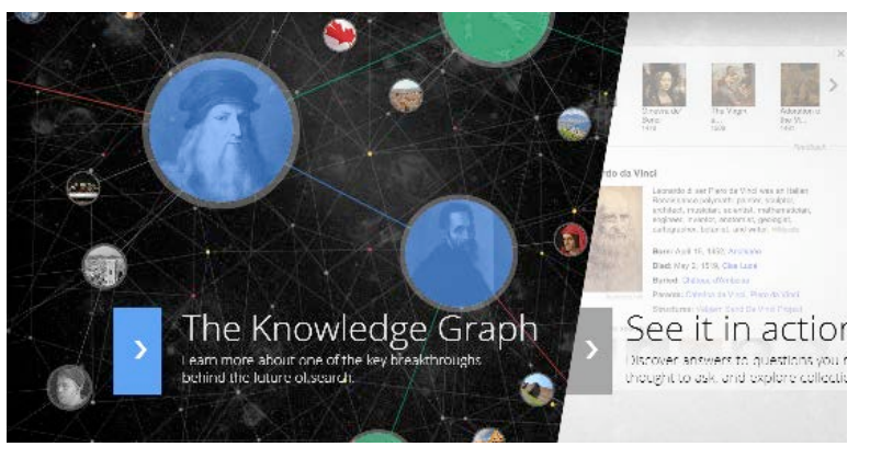
Figure 5: The opening page of Google's Knowledge Graph [30]

Semantic Web Technologies are destined to be integrated into new type of large scale applications. One only has to look at what Goggle's Knowledge Graph is capable today, to appreciate the significance of this development.